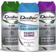
Dabur Air Sanitizer Spray